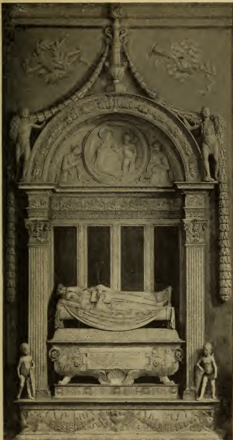
MONUMENT TO CARLO MARZUPPINI